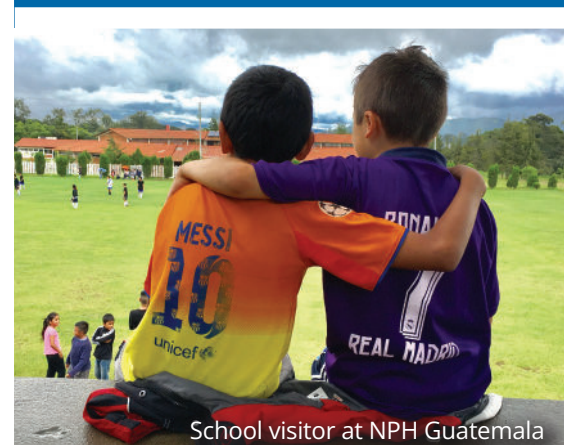
School visitor at NPH Guatemala