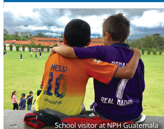
School visitor at NPH Guatemala