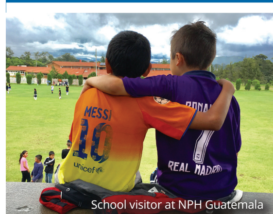
School visitor at NPH Guatemala