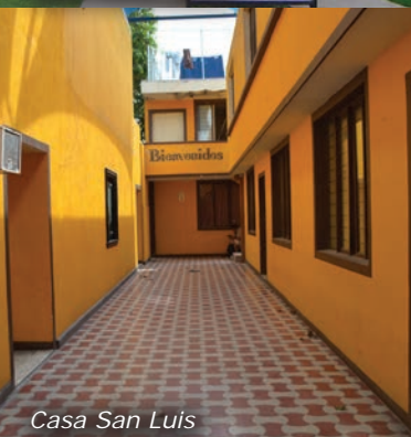
Casa San Luis