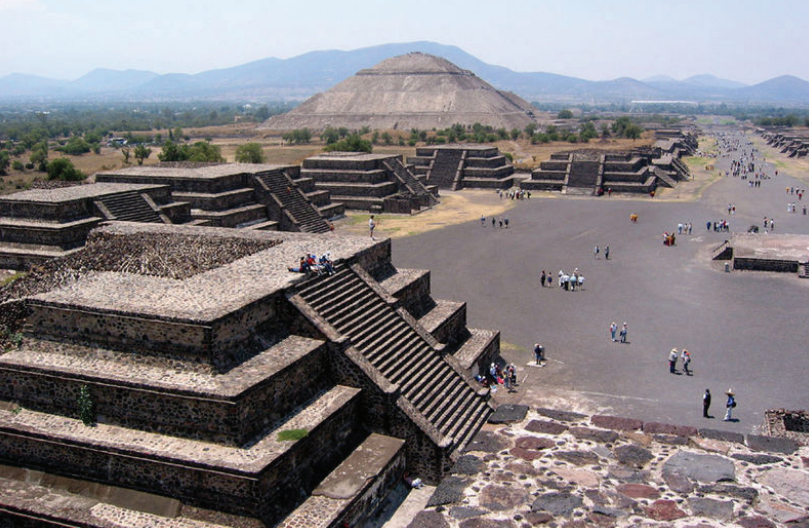
Pyramid of The Sun and Avenue of The Dead, Teotihuacán