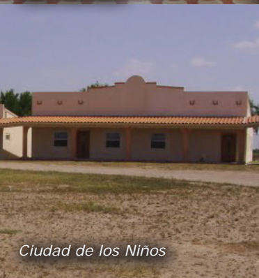
Ciudad de los Niños