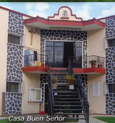
Casa Buen Señor