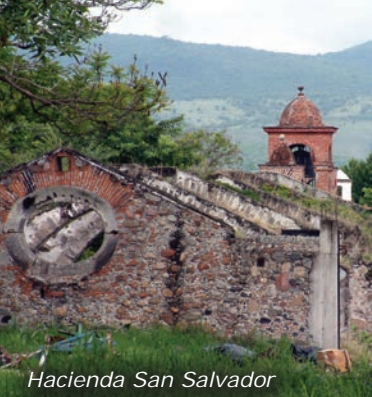
Hacienda San Salvador