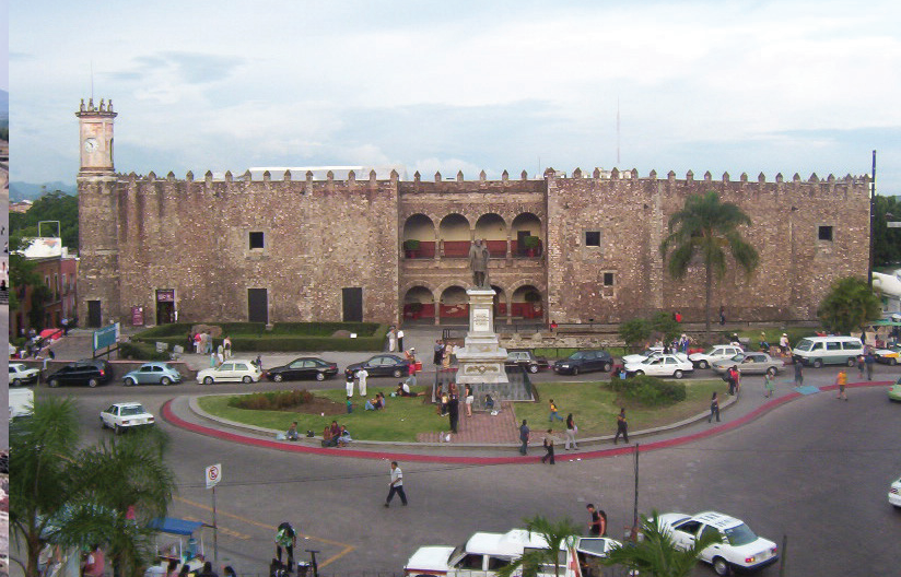
Palace of Hernan Cortés, Cuernavaca