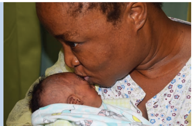
NPH Haiti's St. Damien Pediatric Hospital serves children and high-risk pregnant women.