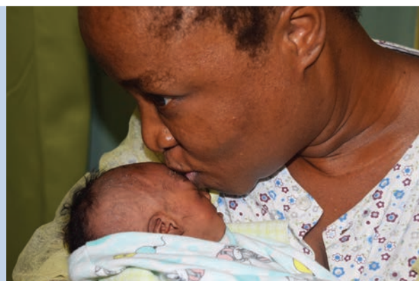
NPH Haiti's St. Damien Pediatric Hospital serves children and high-risk pregnant women.