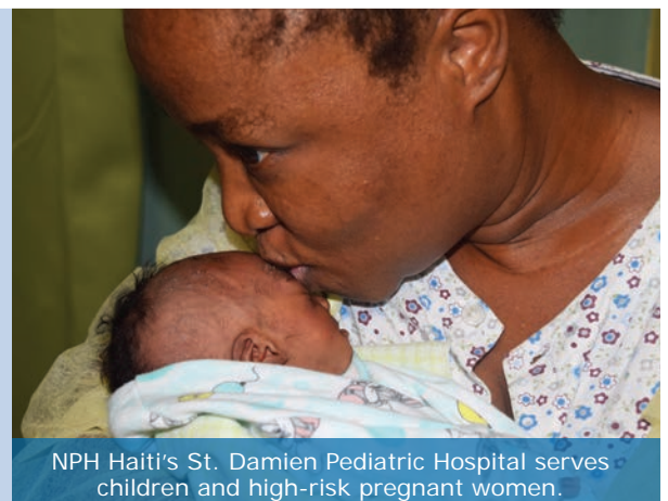
NPH Haiti's St. Damien Pediatric Hospital serves children and high-risk pregnant women.