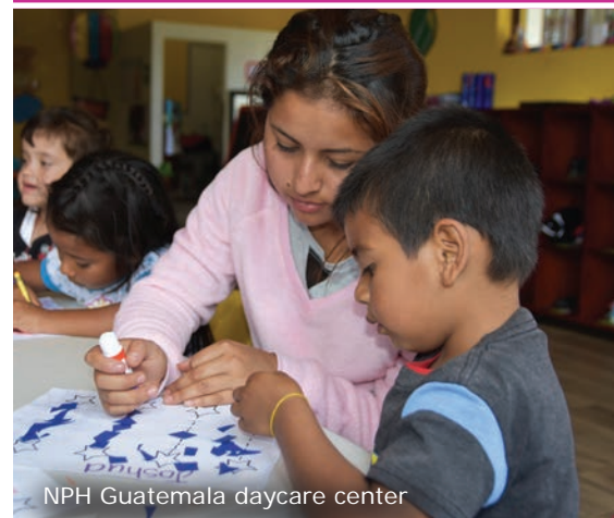
NPH Guatemala daycare center

Founded in 1954, NPH is currently supporting more than 7,600 boys and girls in Bolivia, the Dominican Republic, El Salvador, Guatemala, Haiti, Honduras, Mexico, Nicaragua and Peru. In addition, our community outreach programs provided over 81,000 services in 2020.