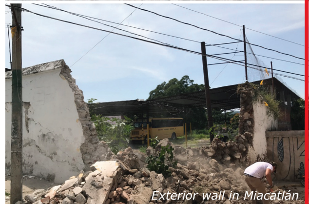
Exterior wall in Miacatlán