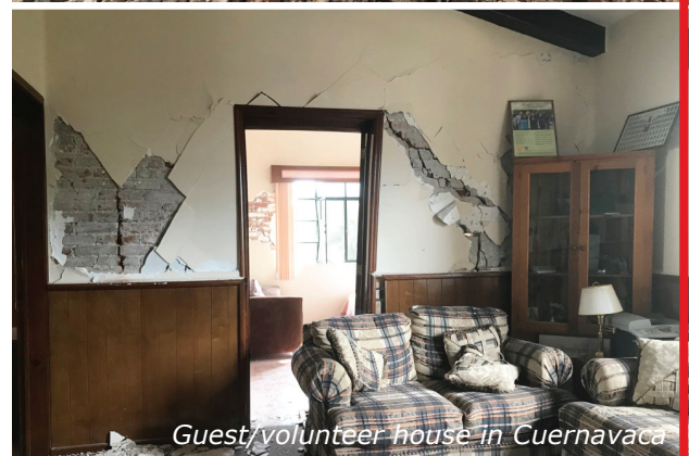
Guest/volunteer house in Cuernavaca