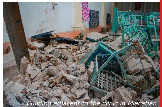
Building adjacent to the clinic in Miacatlán