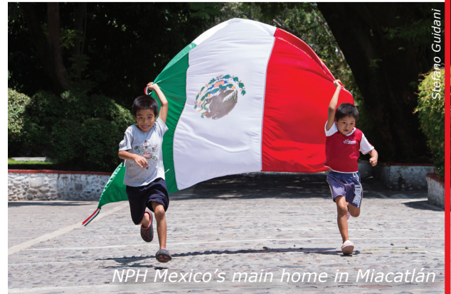
NPH Mexico's main home in Miacatlán

NPH USA is a registered 501(c)3 nonprofit corporation, Federal Tax ID# 65-1229309. Donations are tax deductible to the extent provided by law. All donated funds are diligently appropriated and an audited financial statement is available upon request.